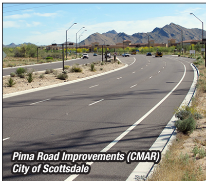
Pima Road Improvements (CMAR) City of Scottsdale

I would like to say thank you to all of our employees, clients, and partners for all you have done in making our first 25 years so very successful. We look forward to many more years of working together as we continue to shape our community.