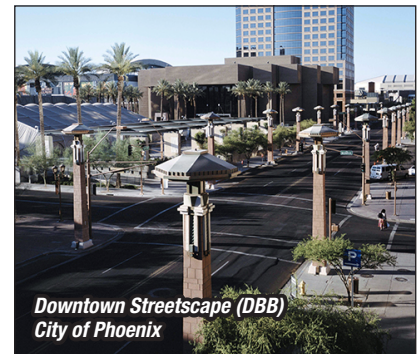
Downtown Streetscape (DBB) City of Phoenix